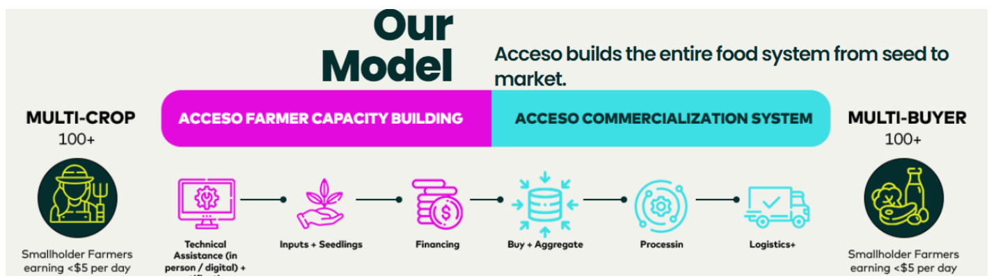
Figure 1. Acceso social enterprise model for Lavi Peanut Butter.

Lavi Peanut Butter is setting the standard for Haiti peanut butter designed to meet international markets. Profits from the sale of Lavi Peanut Butter are used to support the production of Nourimanba. Nourimanba is a peanut-based ready-to-use therapeutic food (RUTF) supplemented with black bean protein, vitamins, and minerals produced for Zanmi Lasante (Partners In Health) to treat malnutrition in Haitian children.