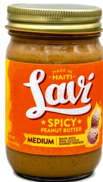
Figure 4. Traditional spicy version of Lavi peanut butter.

More importantly, Acceso, Lavi Peanut Butter, and the HFSA could serve as a new innovative philanthropic model that creates a sustainable safe food system solution in Haiti that addresses the root causes of poverty in local communities. Though food safety science and microbiological controls are essential, it is also just as important that local communities effectively adapt these practices to meet international food safety standards.